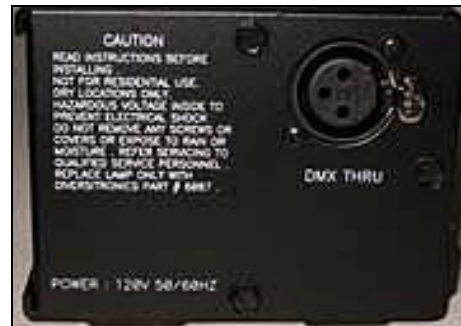
RIGHT HAND FEED THRU