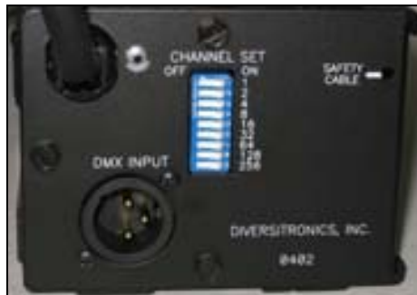
LEFT HAND INPUT